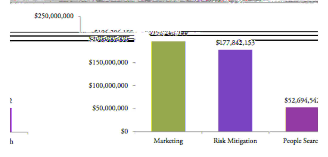
Exhibit 2: Povenue of Nine Date Brokers by Broduct Category

Vjku rtqrqucn ku ck ogf cv vjg oqpgvk|cvkqp qh jgcnvj ectg fcvc0 Jqygxgt eqpukfgt jqy vjku octmgv uvtwevwtg eqwnf dg vtcpuncvgf kh vjg fcvc kpfwuvt{ ygtg hwtvjgt fkxkfgf kpvq ugevqt urgekhke uwdoctmgvu wukpi vjku v{rg qh eqqmkg hknvgtkpi0